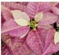
Fuchsia Poinsettia $16.00