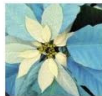
Blue Poinsettia $16.00