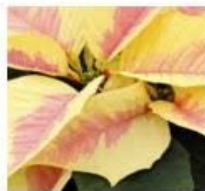
Marble Poinsettia $16.00