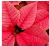
Pink Poinsettia $14.00