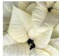
White Poinsettia $14.00