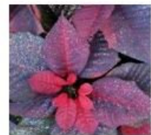
Chameleon Poinsettia $16