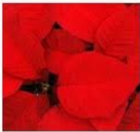
Red Poinsettia $14.00