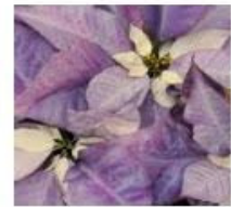
Purple Poinsettia $14.00